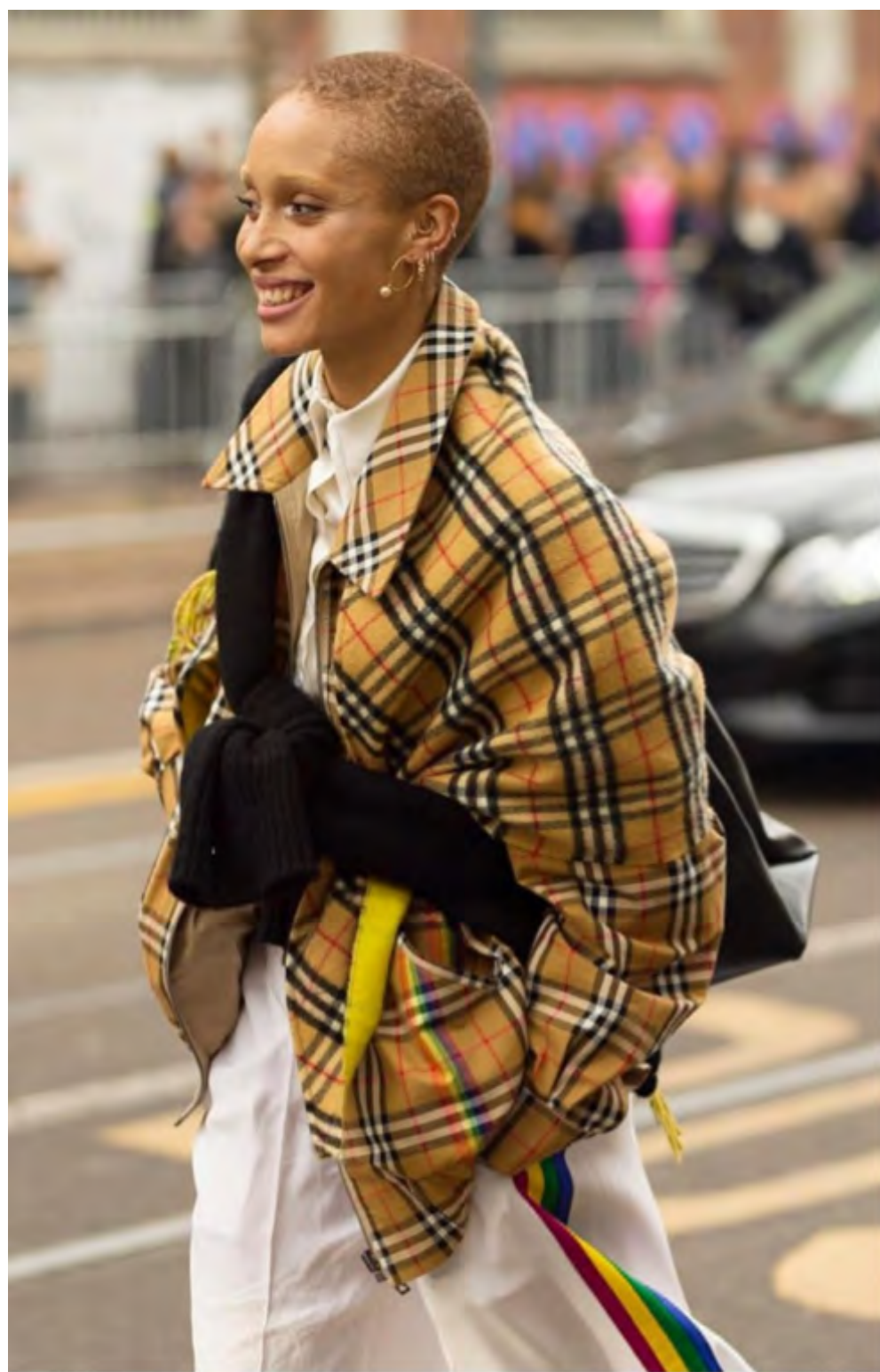
Model and Activist Adwoa Aboah in SS18