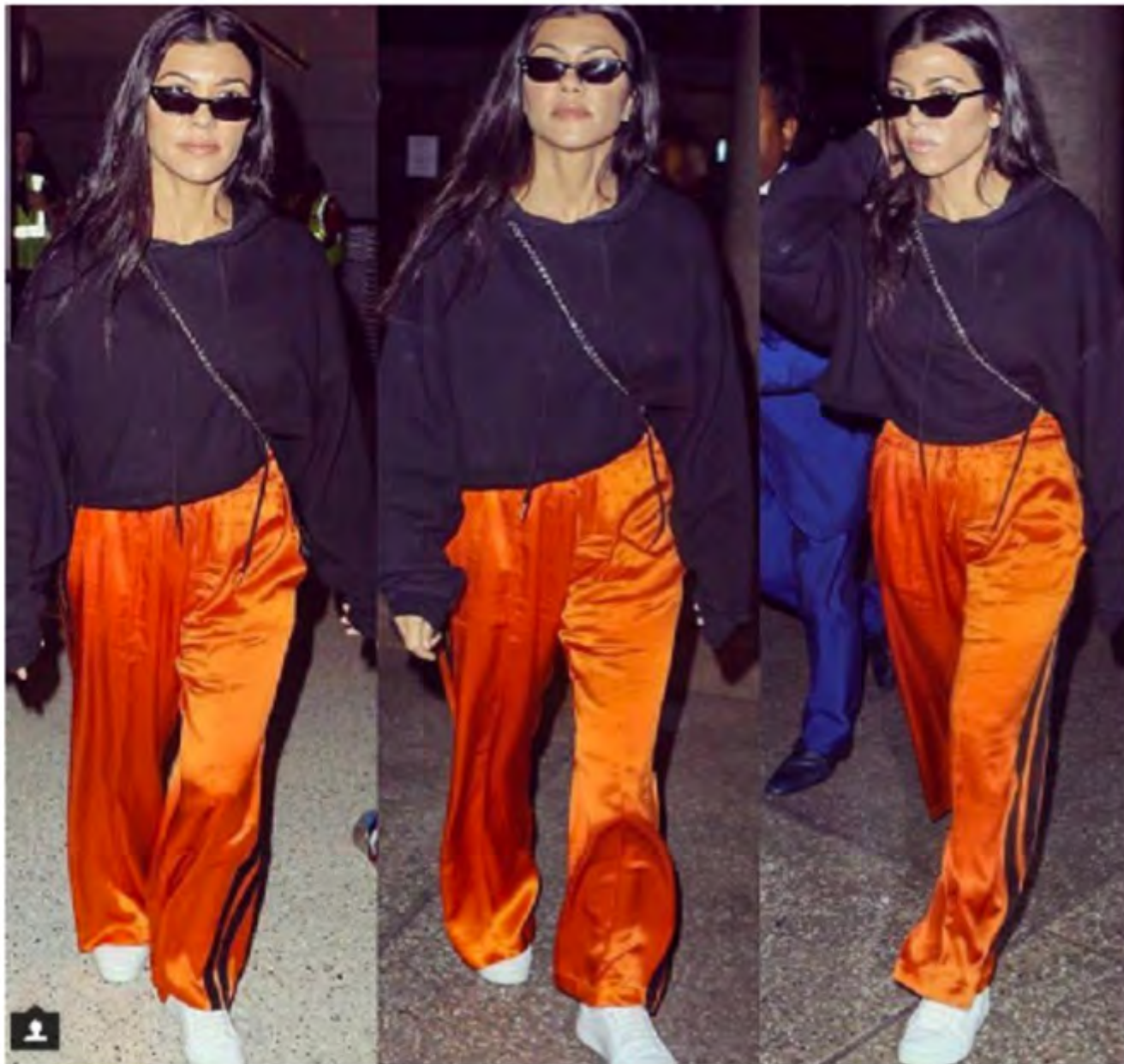
Reality Superstar Kourtney Kardashian in SS17