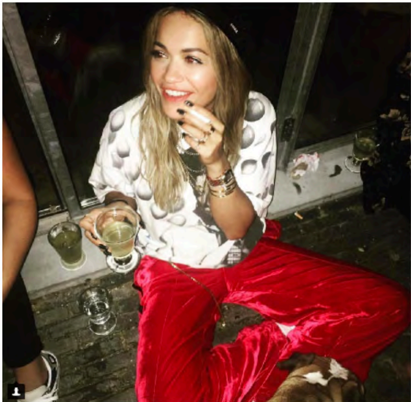
Singer Rita Ora